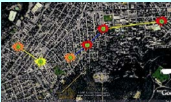
Google Earth map identifying geographical location B-PLC devices.